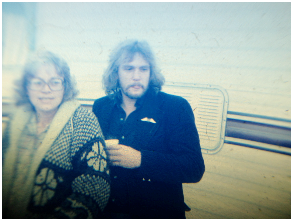
Curt on set of the film Choices , where he and Brian met, 1981